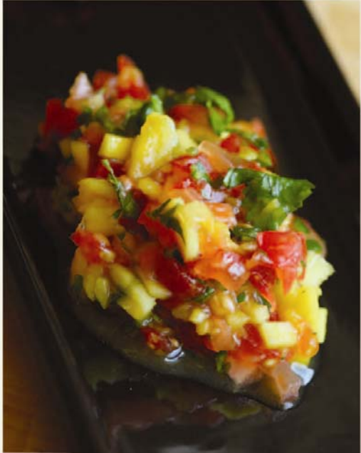
Mango Habanero Dip